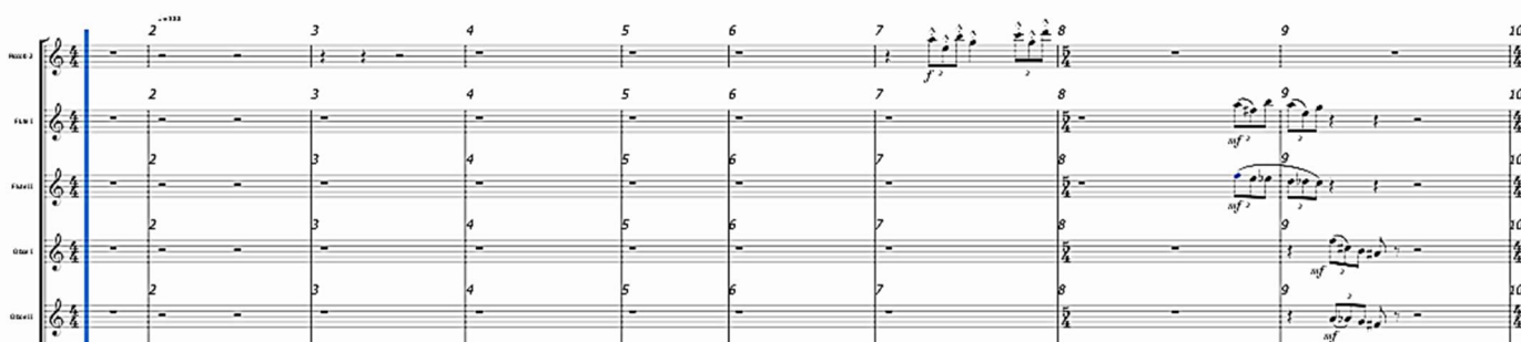
There's the blue cursor, that resolutely sits motionless after I click PLAY.

I click on play, the cursor appears, and...NOTHING.